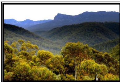
'Ben Lomond National Park from Mangana'