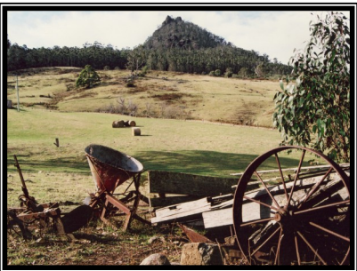
'View to St Patricks Head'

See inside on how we can help to promote you and your business.