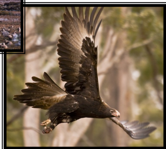
'Eagle in flight in Ben Lomond National Park'