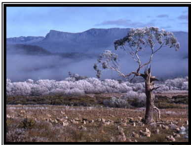
'Frosty morning in the Fingal Valley'